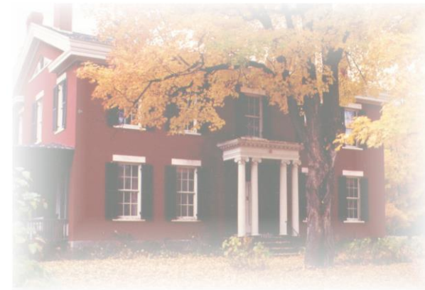
The Hand House

8273 RIVER STREET PO BOX 396 ELIZABETHTOWN, NY 12932